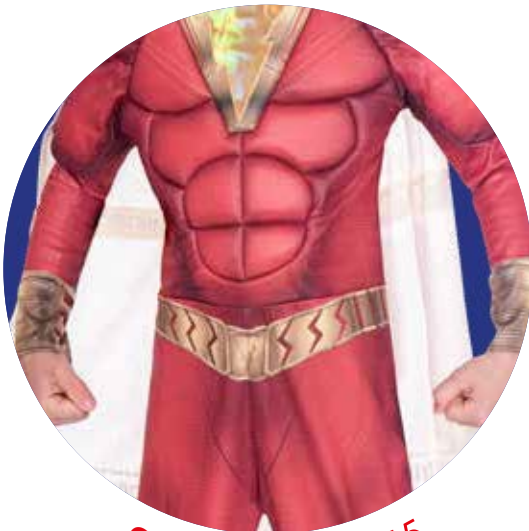
Shazam! Page 15