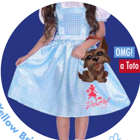
Follow the Yellow Brick Road to Page 22