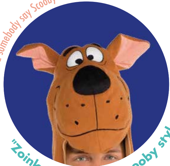
"Zoinks!" Check out Scooby style Page 20