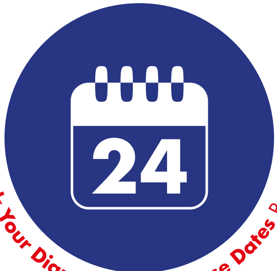
Check Your Diary! Movie Release Dates Page 24