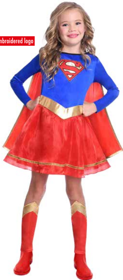
Supergirl Classic Child Dress, detachable cape & leg covers