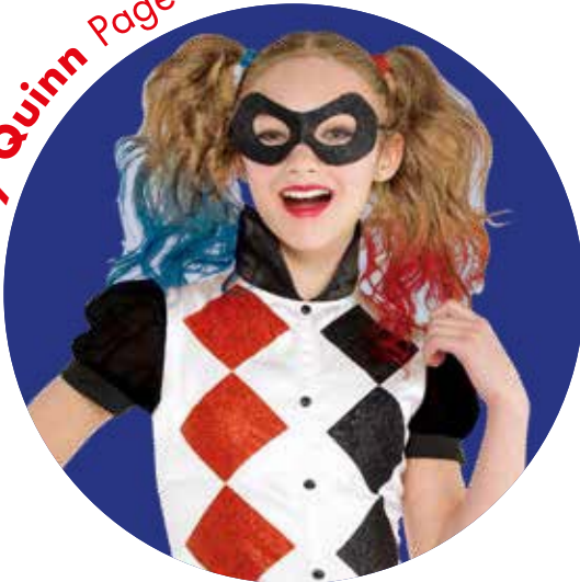
Harley Quinn Page 12