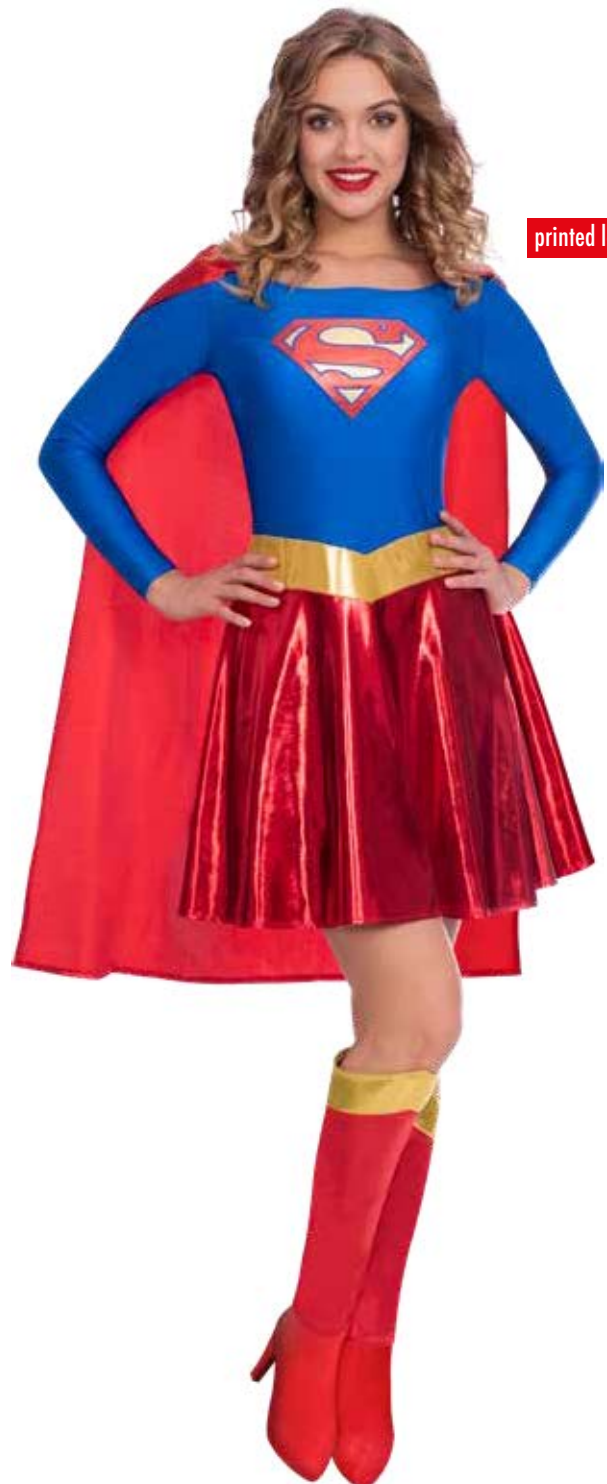
Supergirl Classic Womens Dress, detachable cape & leg covers