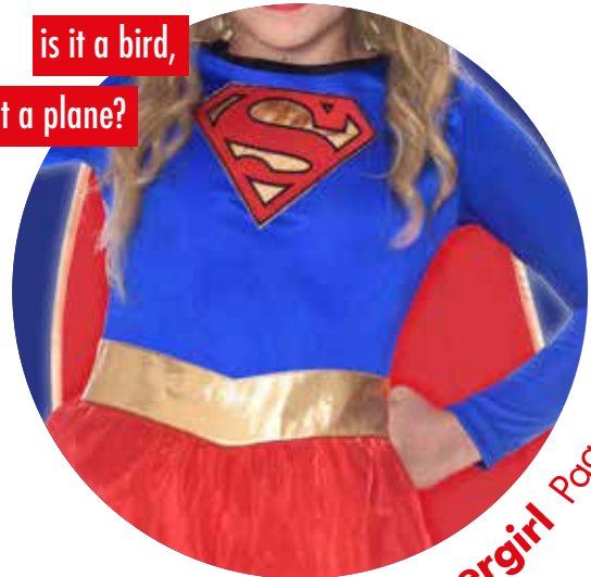
Supergirl Page 17